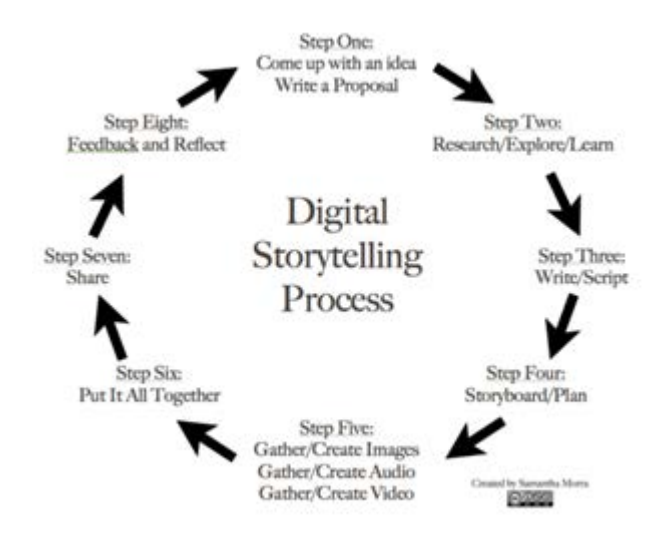
Figure 2. Eight Steps to Create Digital Stories (Samantha Morra, source: <u>8 Steps To Great Digital Storytelling - Transform Learning ~ written by Samantha Morra</u>)

themselves reading their scripts. The next stage is to put it all together. This is where the magic happens – where students discover if their storyboard needs tweaking and if they have enough "stuff" to create their masterpiece. The final two steps are sharing and reflecting. Sharing online has become deeply embedded in our culture. Knowing that other people might see their work often raises student motivation to make it the best possible work that they can do. Finally, students need to be taught how to reflect on their own work and give feedback to others that is both constructive and valuable. Blogs, wikis discussion boards, and student response systems or polling tools can all be used to help students at this stage."