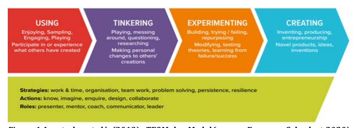
Figure 1. Loertscher et al.'s (2013) uTEC Maker Model

The uTEC Maker Model (Loertscher et at., 2013) visualizes the developmental stages of creativity from individuals and groups as they develop from passively using a system or process to the ultimate phase of creativity and invention. As illustrated in the model below, there are four levels of expertise.